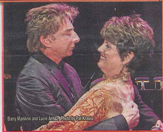
Barry Manilow and Lucie Arnaz.