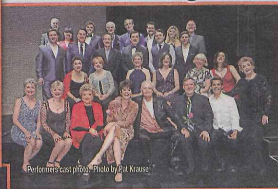
Performers cast photo.